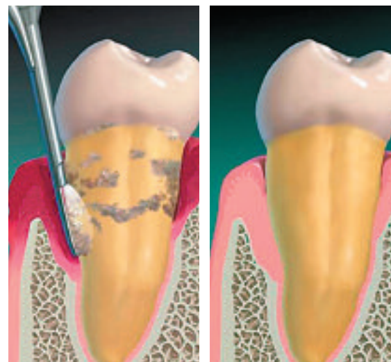
The first image illustrates the large amount of subgingival calculus that can be left behind following "blind" root planing. Because of this, chronic disease persists. The second image demonstrates a post-perioscopy tissue response; health is restored non-surgically.

Undetected burnished subgingival calculus containing pathogenic bacteria is lurking everywhere, wreaking havoc on the sulcular epithelium, cementum, PDL fibers, and alveolar bone. These burnished "condos" for bacteria go unnoticed for years, as chronic and/or acute infection often ensues. Well-intentioned clinicians may use everything from blind root planing and lasers, to LAAs (locally applied anti-